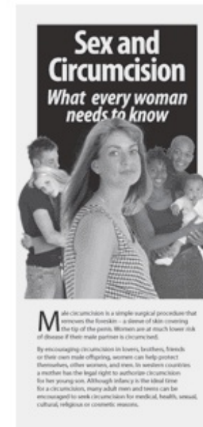
black & white brochure

"Yes, of course Rabbi, here it is!" said the shopowner, he handed the Rabbi a small flat round