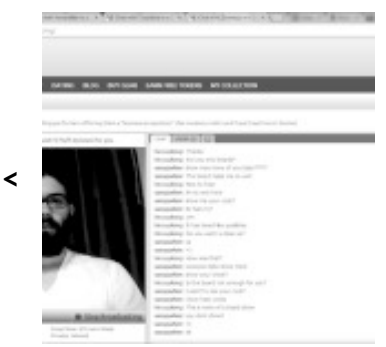
(http://kernelmag.dailydot.com (http://kernelmag.dailydot.cor /features/report/4748/iwas-almost-a-webcam-