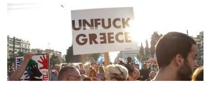
Five Predictions for How the Greek Crisis Could Play Out (/en_se/read/sam-kriss-greek-crisis-010)