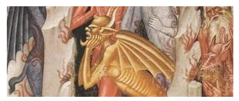
Castrating Boys and Dismembering Women Out of Boredom: 30 Years of Satanic Crimes (/en_se/read/thirty-years-of-satanic-crimes-876)