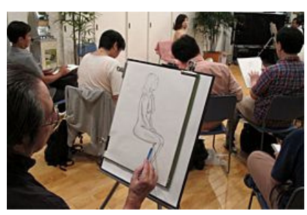
So Many 30-year Old Virgins... So Little Interest?