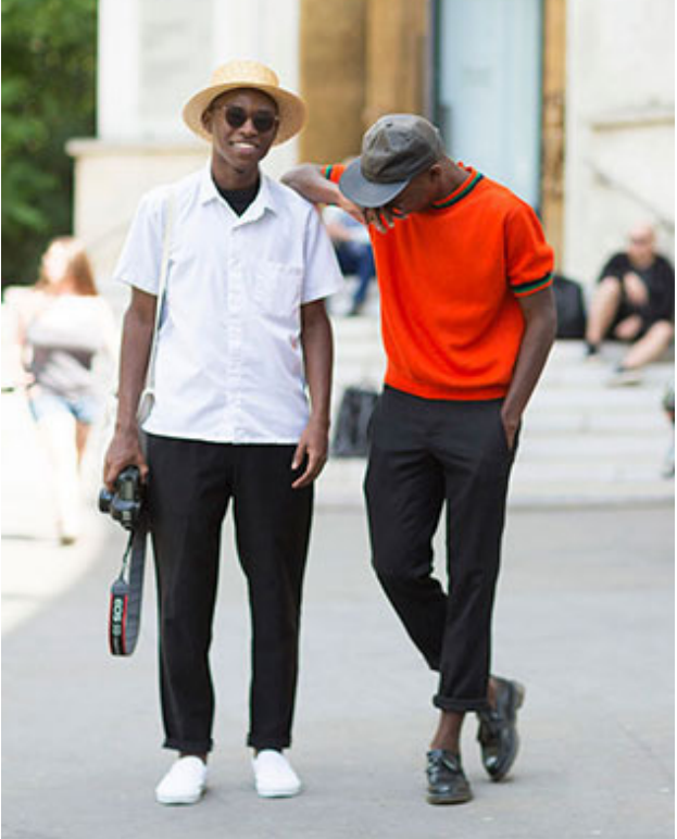
house & home