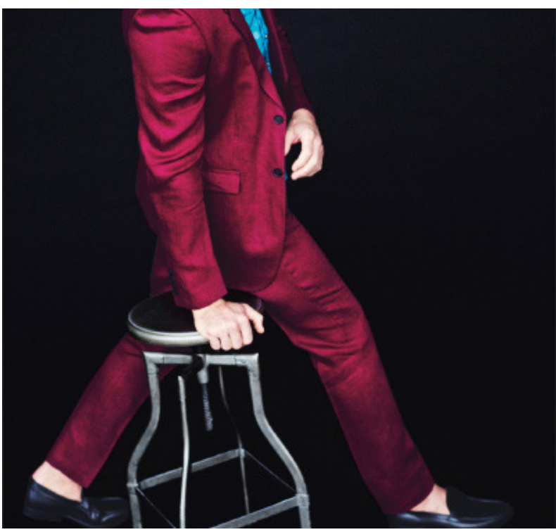
DETAILS DAILY NEWSLETTER

Get the latest in men's style, grooming, health, and pop-culture news every day.