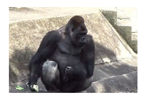
Handsome Gorilla Develops Fervent Female Following in Japan