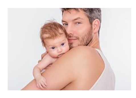
32 Random Facts about Men RANDOM FACTS | FUN TRIVIA | INTERESTING INSIGHT