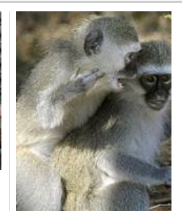
Call of the wild